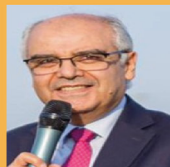
Regional Director for the Gulf of WHO