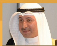
Assistant Foreign Minister for International Organizations Affairs