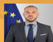
European Union Head of Delegation, Kuwait