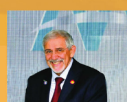
President of Kuwait Red Crescent Society