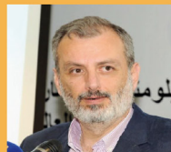
UNHCR Representative in Kuwait