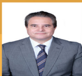
UNSG Representative Resident Coordinator, Kuwait