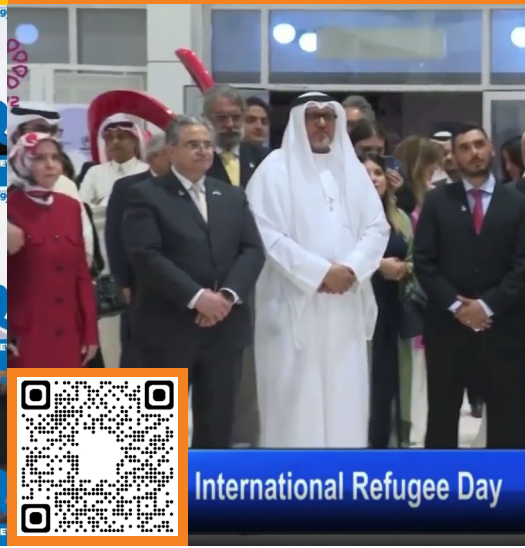
International Refugee Day