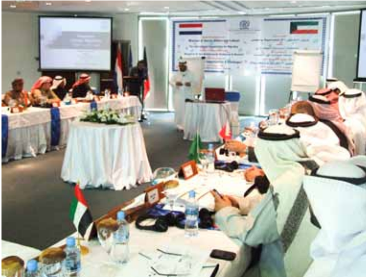
A Regional Workshop on: Management of Temporary Contractual Labour in the GCC United Nations House – State of Kuwait May 2011