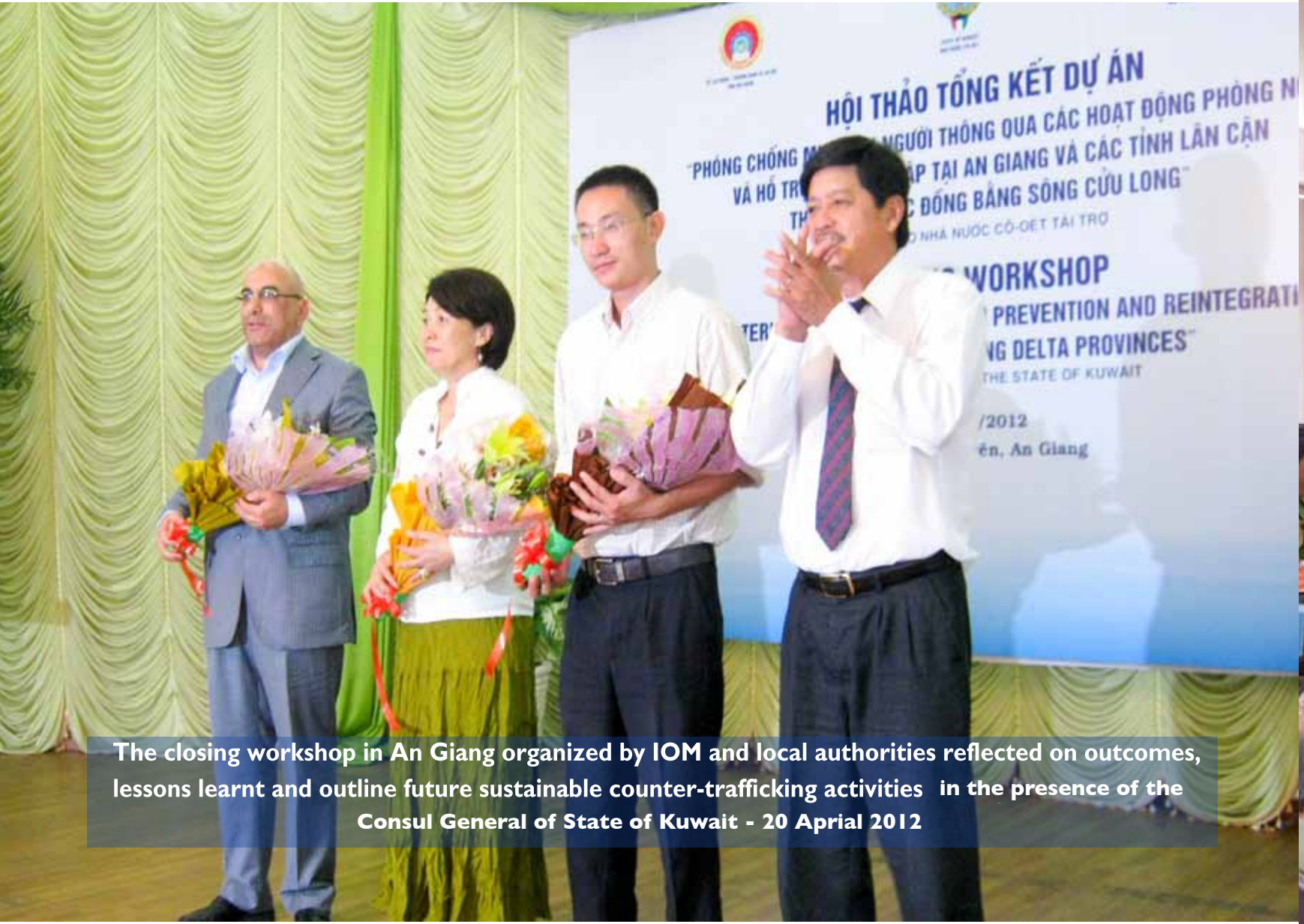
The closing workshop in An Giang organized by IOM and local authorities reflected on outcomes, lessons learnt and outline future sustainable counter-trafficking activities in the presence of the Consul General of State of Kuwait - 20 April 2012