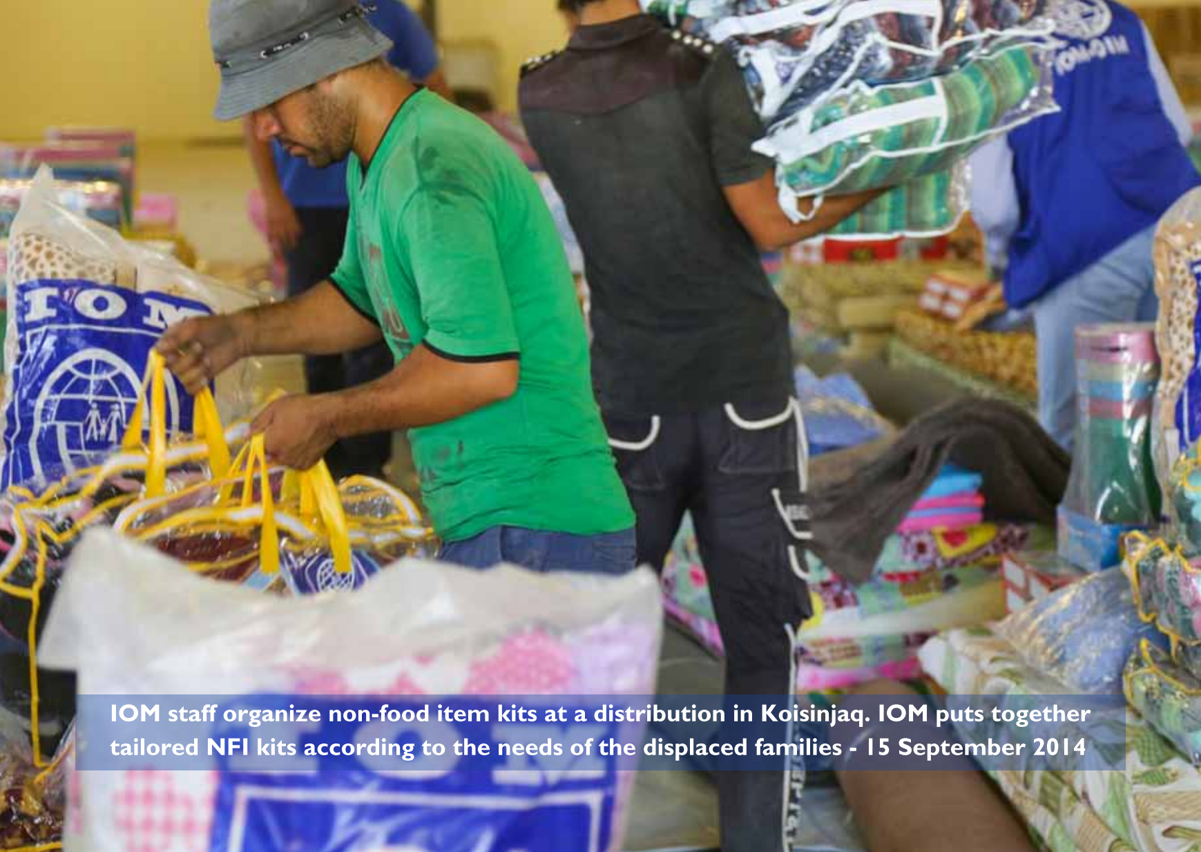
IOM staff organize non-food item kits at a distribution in Koisinjaq. IOM puts together tailored NFI kits according to the needs of the displaced families - 15 September 2014