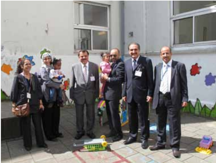
Yemeni high officials visit to the State of Kuwait to Explore Kuwaiti Experience on Counter Trafficking December 2011