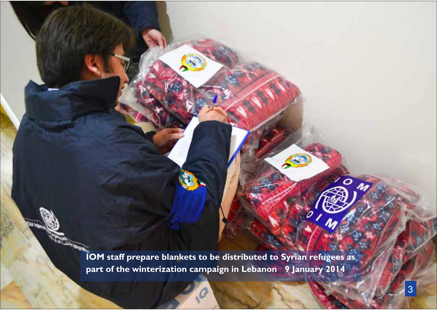
IOM staff prepare blankets to be distributed to Syrian refugees as part of the winterization campaign in Lebanon 9 January 2014