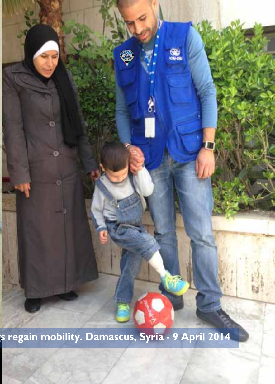
Prosthetic limbs help children who lost their legs regain mobility. Damascus, Syria - 9 April 2014