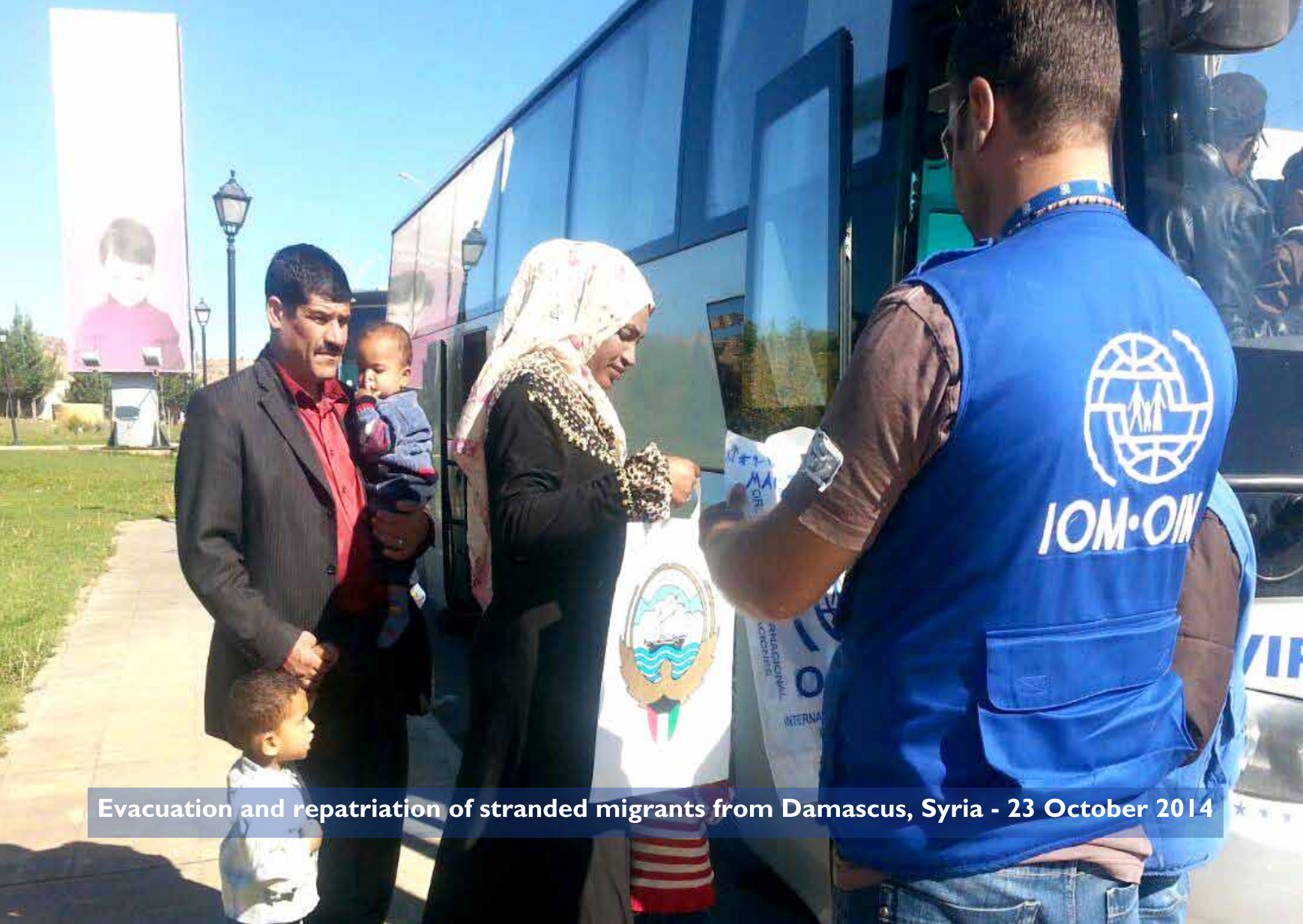
Evacuation and repatriation of stranded migrants from Damascus, Syria - 23 October 2014