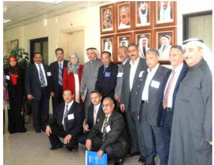
Kuwaiti High Officials in on visit to shelters in Holland June 2011