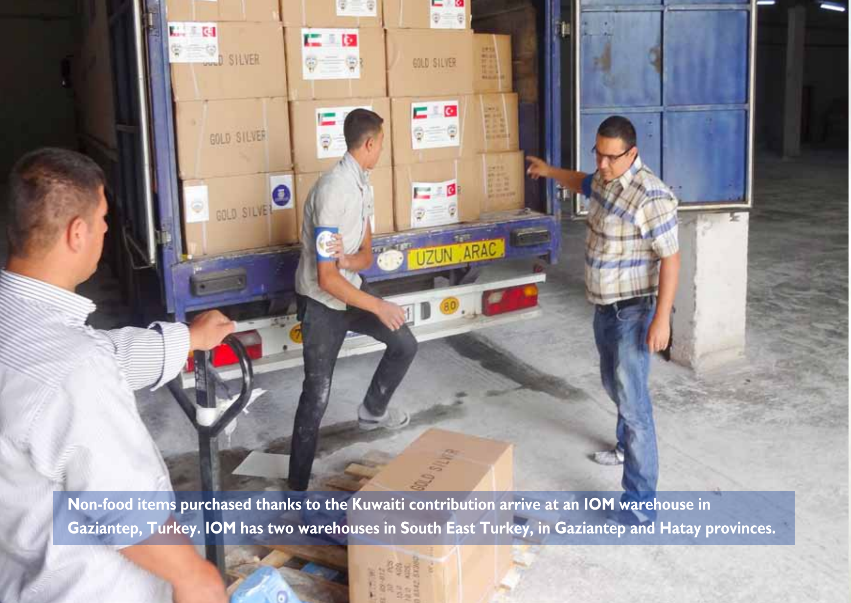
Non-food items purchased thanks to the Kuwaiti contribution arrive at an IOM warehouse in Gaziantep, Turkey. IOM has two warehouses in South East Turkey, in Gaziantep and Hatay provinces.