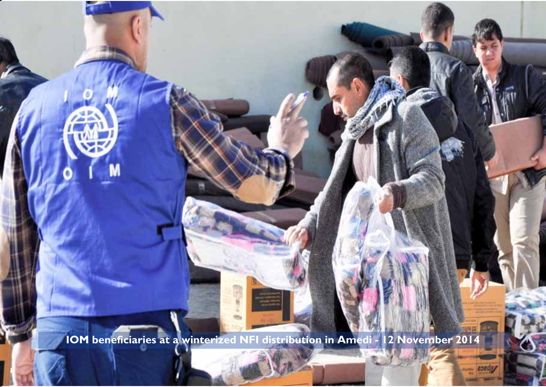
IOM beneficiaries at a winterized NFI distribution in Amedi - 12 November 2014