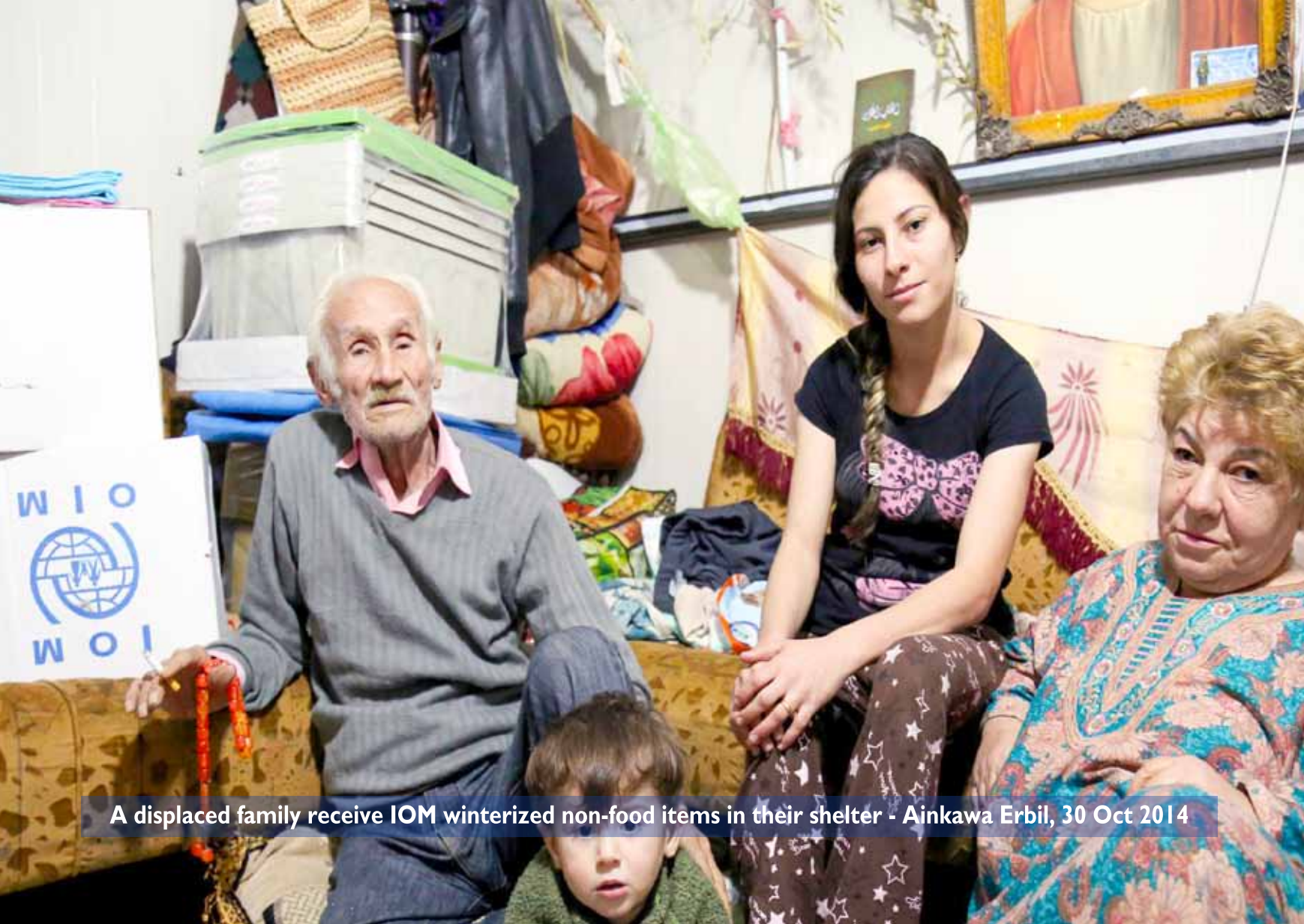
A displaced family receive IOM winterized non-food items in their shelter - Ainkawa Erbil, 30 Oct 2014